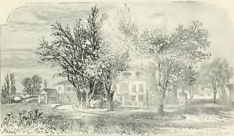
THE OLD PIERREPONT HOME ON BROOKLYN HEIGHTS, 1838